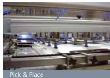
Pick & Place